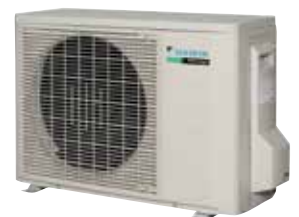
Outdoor unit RXS25-35L

Daikin has a worldwide reputation based on 90 years' experience in the successful manufacture of high quality air conditioning equipment for residential, commercial and industrial use and 56 years as a leader in heat pump technology.