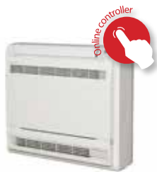
Indoor unit FVXS25,35,50F

(1) EER/COP according to Eurovent 2012, for use outside EU only.