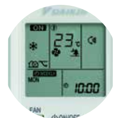
Infrared remote control (Standard) ARC452A1